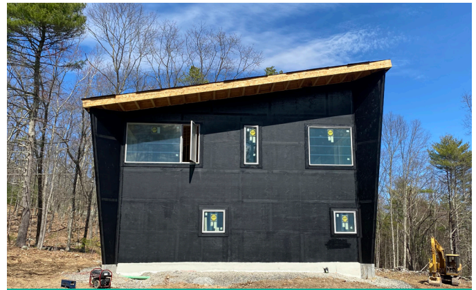
Enviro-Dri protects walls from liquid moisture while reducing condensation in the wall cavity.