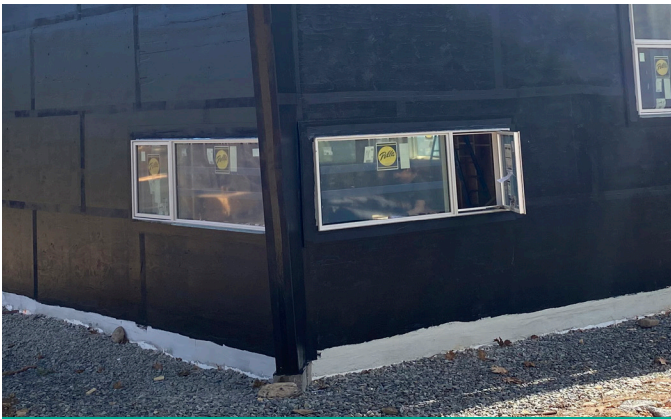
Horizon complements Enviro-Dri to provide footing-to-sill plate moisture protection.